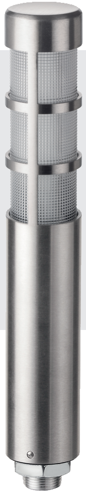
Size comparison deSIGN 42 / KombiSIGN 72