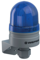
Bracket mounting with cable gland