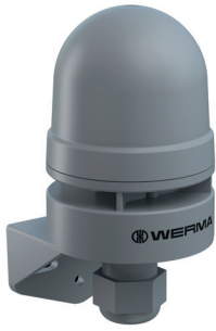
Bracket mounting with cable gland