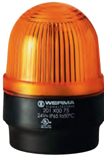
LED Permanent Beacon 201 (base mounting)