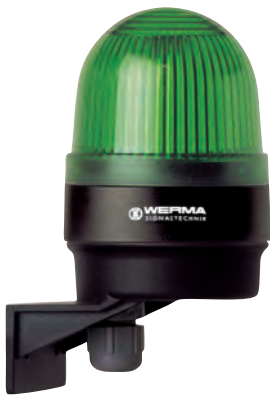
LED Permanent Beacon 204 with integrated mounting bracket