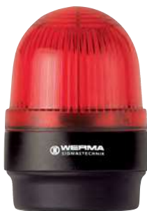
Flashing Beacon 202 (base mounting)