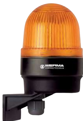
Flashing Beacon 205 with integrated mounting bracket