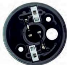
Housing with CAGE CLAMP® connection