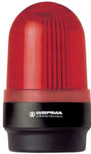
LED Permanent Beacon 211 (base mounting)