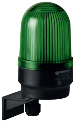
LED Permanent Beacon 214 with integrated mounting bracket