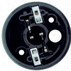
Housing with CAGE CLAMP® connection