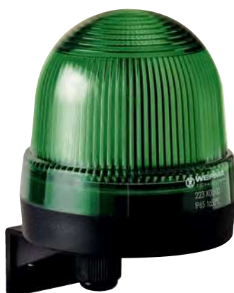
LED Permanent Beacon 224 with integrated mounting bracket