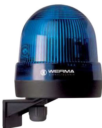
Flashing Beacon 225 with integrated mounting bracket