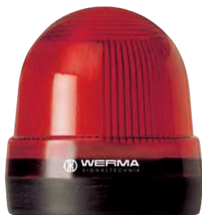
Flashing Beacon 222 (base mounting)