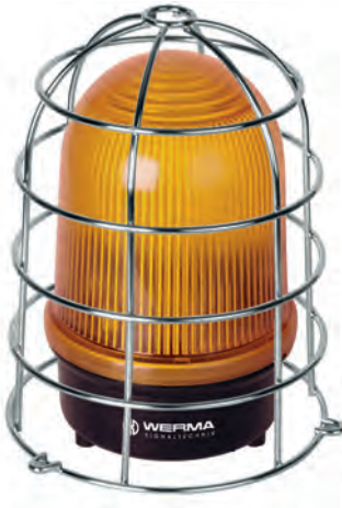
Wire guard (accessory)