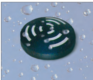
High protection rating IP 65 for use in arduous conditions