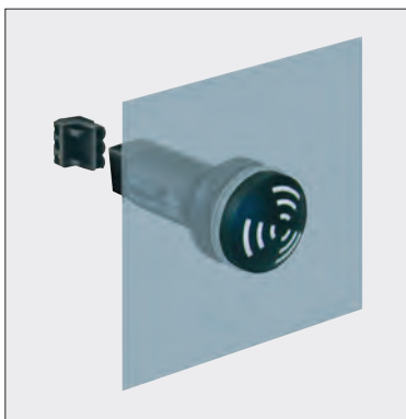
Simple connection by means of connector plug