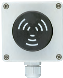
Surface housing (accessory)