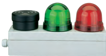
Surface housing (triple) for 2 beacons and 1 audible element (not included in assembly)