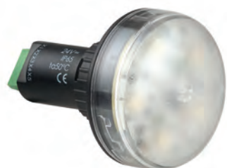
LED Installation Beacon (Multicolour)