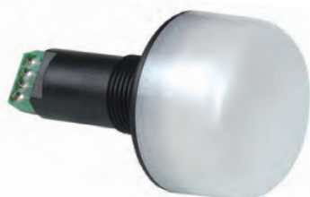
LED Installation Beacon (Multicolour) with raised lens